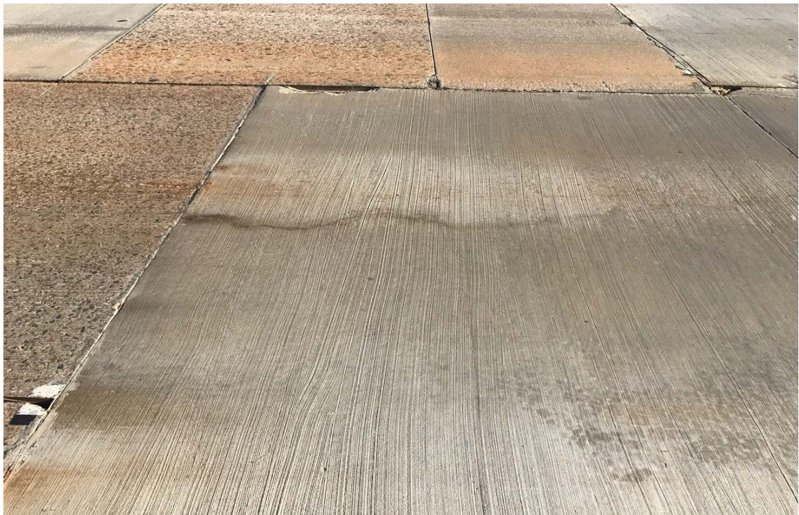
Figure 2. Control slab on I-20 Field trial showing clearly visible crack extending across entire slab after 14 months of highway use.

The clearly visible crack now extends across the whole control slab ( see Figure 2 below ). The EdenCrete trial slab is shown in Figure 3 below.