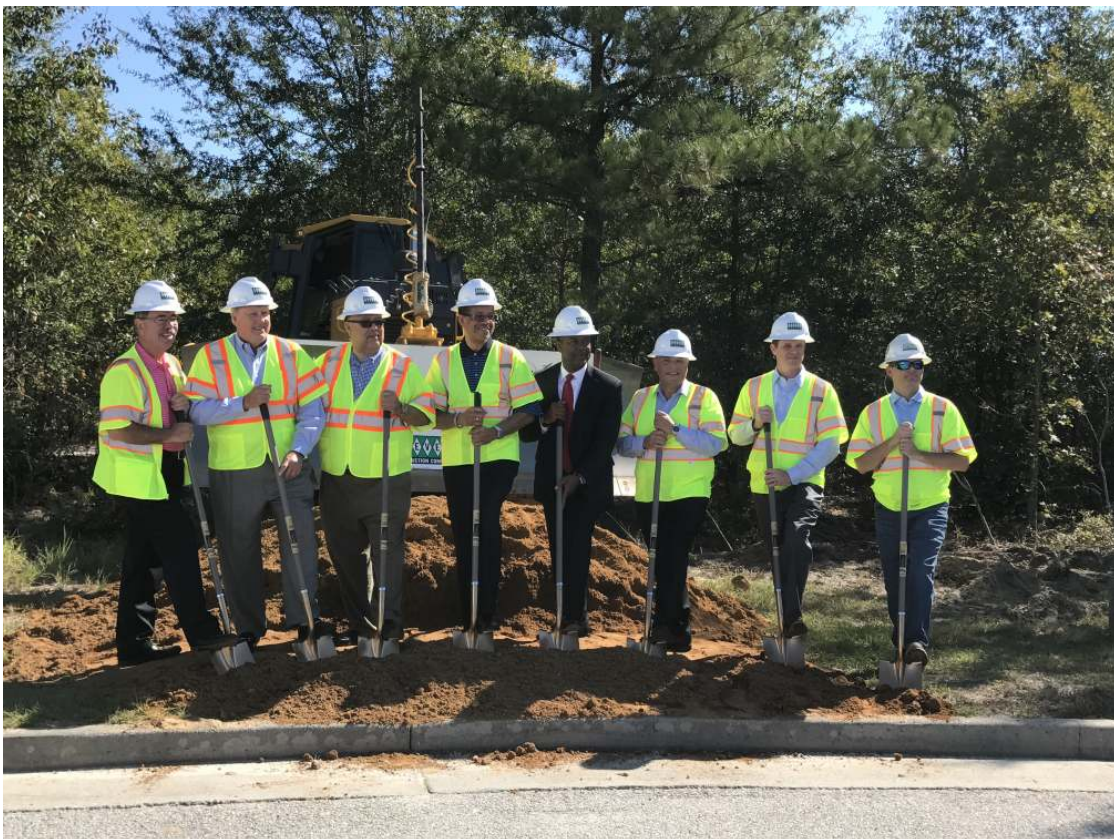
Figure 1. Commemoration of the start of construction of the access road.

A formal opening ceremony (see Figure 1) was held in Augusta yesterday (Monday 17 October 2016), organised by the Augusta Economic Development Authority (“AEDA”), to commemorate the commencement of the building of the 3.2 kilometre two lane bitumen access road through its 1,800 acre (728 hectares) Augusta Industrial Park to provide access including to the proposed large scale EdenCrete™ production facility.