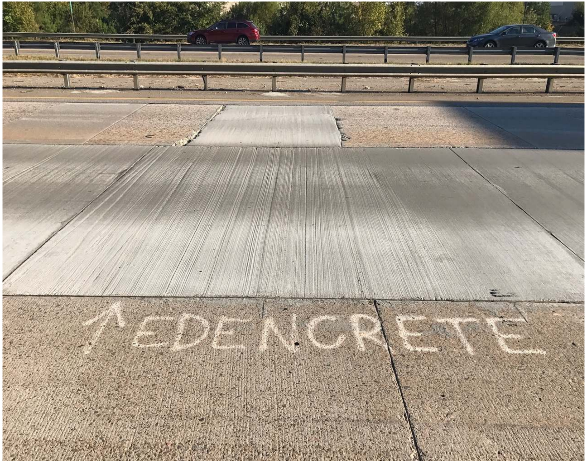
Figure 3. EdenCrete™ trial slab on I-20 Field trial showing no cracking or visible wear after 14 months of highway use.

As previously advised, this section of the I-20 highway is subject to significant water flow beneath the road surface that causes undermining of the subsurface, which in turn reduces support for the road surface and leads to cracking.