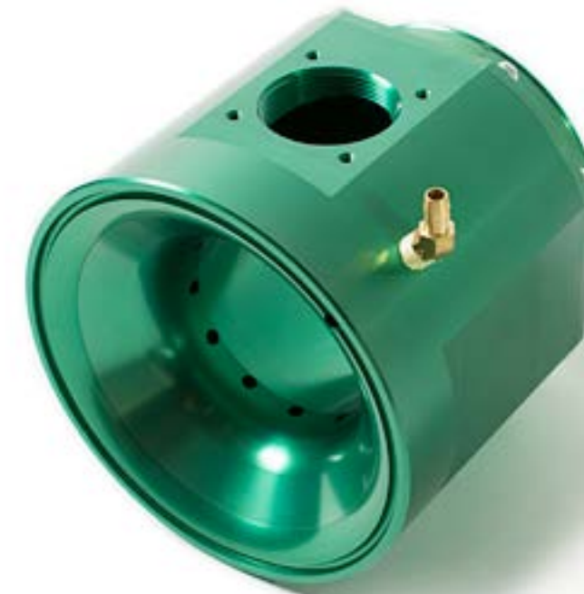
AIR-GAS MIXER (AGM)

Natural gas is delivered to the combustion chamber using the existing air intake system. The OptiBlend® proprietary Air-Gas Mixer (AGM) is installed just downstream of the stock air filter where it dictates the air-to-gas ratio in conjunction with the OptiBlend® Fuel Control Valve (FCV). The mixer uses the Venturi effect to draw gas into the engine. The fuel control valve has a 10-20 millisecond reaction time, allowing immediate throttle adjustment in response to changes in engine load. The fuel control valve utilizes internal software with fault detection and position control and is controlled by the Programmable Logic Control (PLC). Each OptiBlend® kit is custom fit and commissioned for your specific engine and application.