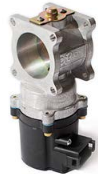
FUEL CONTROL VALVE (FCV)